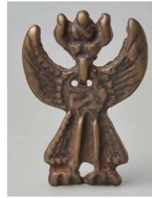
Fig. 6 Standing bird with spreading wings, little dots on each wing and with a fire-shaped head, bronze, Ordos region, China. Collection of the University Museum and Art Gallery, Hong Kong.