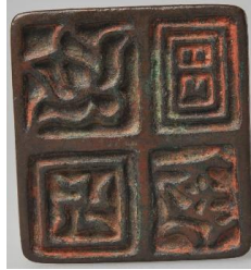
Fig. 9 Bronze seal with loop on the back, in four-square composition inscribed one lotus motif, one swastika, and two unidentifiable characters, bronze, Ordos Region, China. Collection of the University Museum and Art Gallery, Hong Kong.

The inscriptions on these pieces are quite consistent with the well-studied pieces of Yuanya. For instance, there is the most common pattern of a family name decorated with a pictorial sign, indicating a private use of “Ya”—the private signature. Another popular pattern consists of two or four characters in Phags-pa inscribed on the pieces, sometimes in positive form, with the shape of a musical instrument such as Pi-pa or Bell (fig. 11), or of an animal, in this case, hares and possibly also birds, but the latter needs further study.