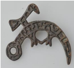
Fig. 5 Paired-bird motif decorated object with one bird missing, bronze, Ordos region, China. Collection of the University Museum and Art Gallery, Hong Kong.