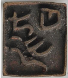
Fig. 10 Bronze seal with loop on the back, two Chinese characters “Jiu” (九) and “Ri” (日) inscribed, which means nine days in combination, Ordos Region, China. Collection of the University Museum and Art Gallery, Hong Kong.

Generally, the inscriptions are mainly in 1) Phags-pa, 2) Chinese characters, 3) an ethnic language, and 4) an unidentifiable character or pictorial pattern. 30,31