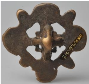
Fig. 12 Cross shape piece with loop on the back which sticking out of the hollowed area, Ordos Region, China. Collection of the University Museum and Art Gallery, Hong Kong.

Mostaert's witness, which will be mentioned later in this article. But this hypothesis still cannot give a satisfactory answer to the redundancy of the worked-out design, since the deeply-curved one has already facilitated the printing on hard mediums such as mud. And not only so, the distinctive reprocessing traces, especially with those worked-out pieces, on the surface of the backboard where the loop/loops were attached, and in some cases, the lack of harmony caused by the sullied worked-out design where the attached loop/loops stick out of the purposed hole (fig. 12), drives us to query the originality of the loop/loops, or of the worked-out design. Therefore, before more evidence is interrogated, we should not jump so readily from the hypothesis of the medium to an overall interpretation.