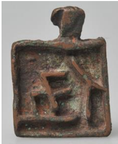
Fig. 7 Bronze seal with loop on the top, inscribed Chinese character “Wu” (五) which could be the family name or a military officer title, bronze, Ordos Region, China. Collection of the University Museum and Art Gallery, Hong Kong.

Most of the Yuanya in Nixon’s collection, namely, the pieces with identifiable characteristic