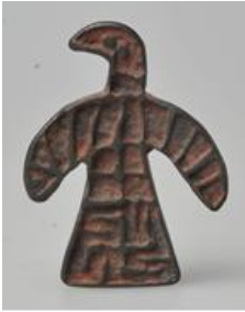
Fig. 3 Bird-shape piece with swastika on front, bronze, Ordos region, China. Collection of the University Museum and Art Gallery, Hong Kong.