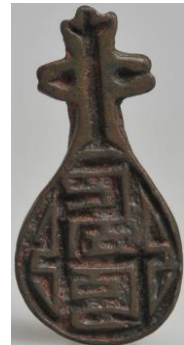
Fig. 11 Bronze seal with loop on the back, Phags-pa character “Ji” (記) indicating to a private seal function on the lower part of the inscription with the phonetic Phags-pa family name on the above, Ordos Region, China. Collection of the University Museum and Art Gallery, Hong Kong.

Furthermore, compared with the abovementioned Yuanya pieces, the cross-shaped ones, if they are really seals, are of a genre that is extremely rare in Chinese seal history. Some may explain the unusualness as a debt to the printing medium, since some believe that the cross-shaped “seals” are