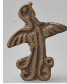
Fig. 4 Mysterious bird with long cloud-like tail resembling to Chinese phoenix motif, bronze, Ordos region, China. Collection of the University Museum and Art Gallery, Hong Kong.