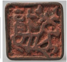
Fig. 8 Bronze seal with loop on the back, inscribed Chinese character “Fu” (福) refers to “the blessing” along with a deer motif which phonetically means “Lu” (祿), so this combination is a typical Chinese auspicious pattern “Fulu” (福祿) which means all the blessings and successes, bronze, Ordos Region, China. Collection of the University Museum and Art Gallery, Hong Kong.

seals, are typically Yuanya style, and hence they fit well in the Chinese seals categories and also with the four characteristics of Yuanya as listed above. Some of them have only one character inscribed (fig. 7), or have one character combined with a pictorial cipher or zoomorphic motif (fig. 8). 29 A very small number of the seals are executed in typical